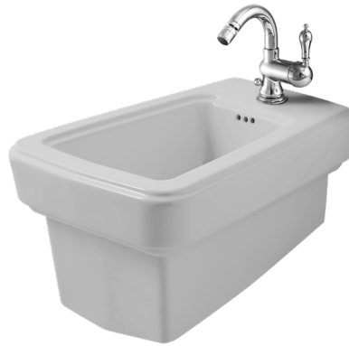
Sanitari e Consolle-Stone PHST13