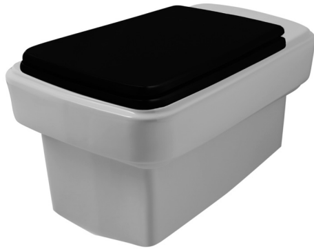
Sanitari e Consolle-Stone PHST11