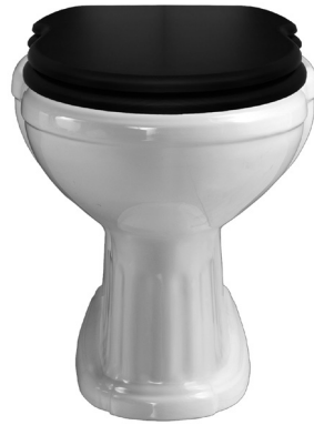
Sanitari e Consolle-Roma PHRM01