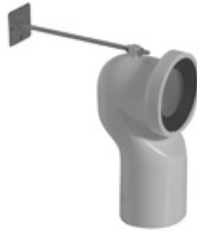
Sanitari e Consolle-Complementi Sanitari PG079F