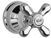
Rubinetti - Newport - RB060