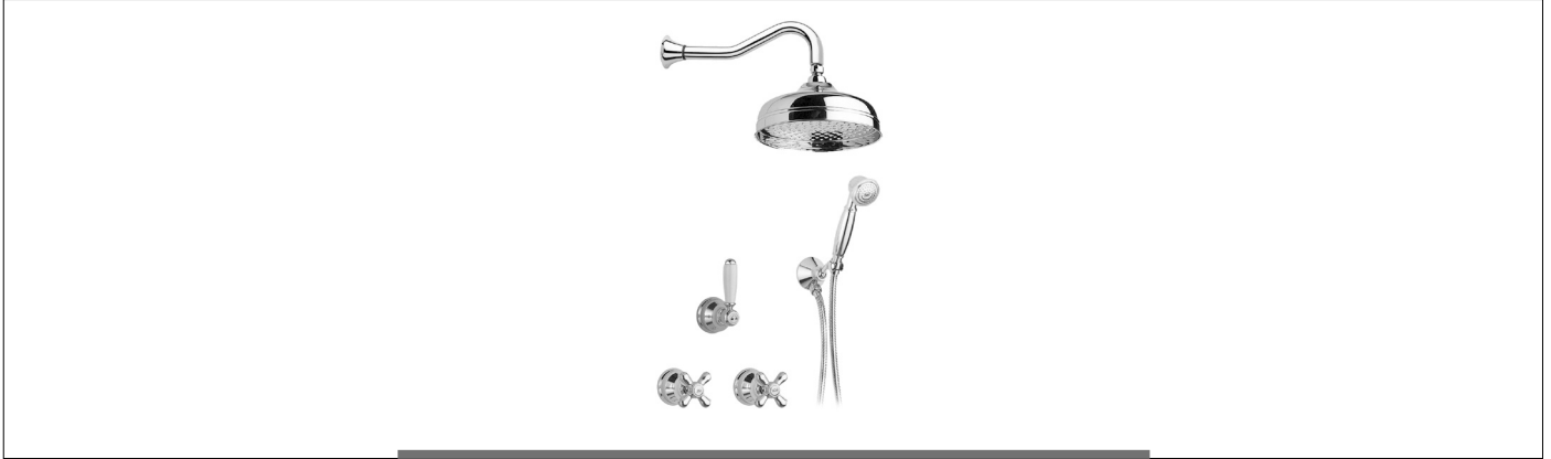
Rubinetti - Newport - RB020