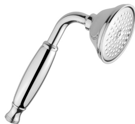
Rubinetti - Complementi - RF821L