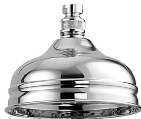
Rubinetti - Complementi - RF4700