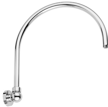
Rubinetti - Complementi - RF323