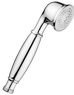
Rubinetti - Complementi - RF256