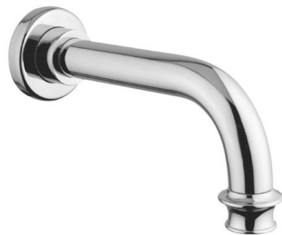
Rubinetti - Complementi - RB19324