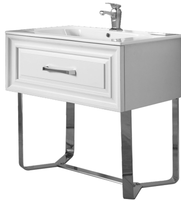
New Style-Flat I