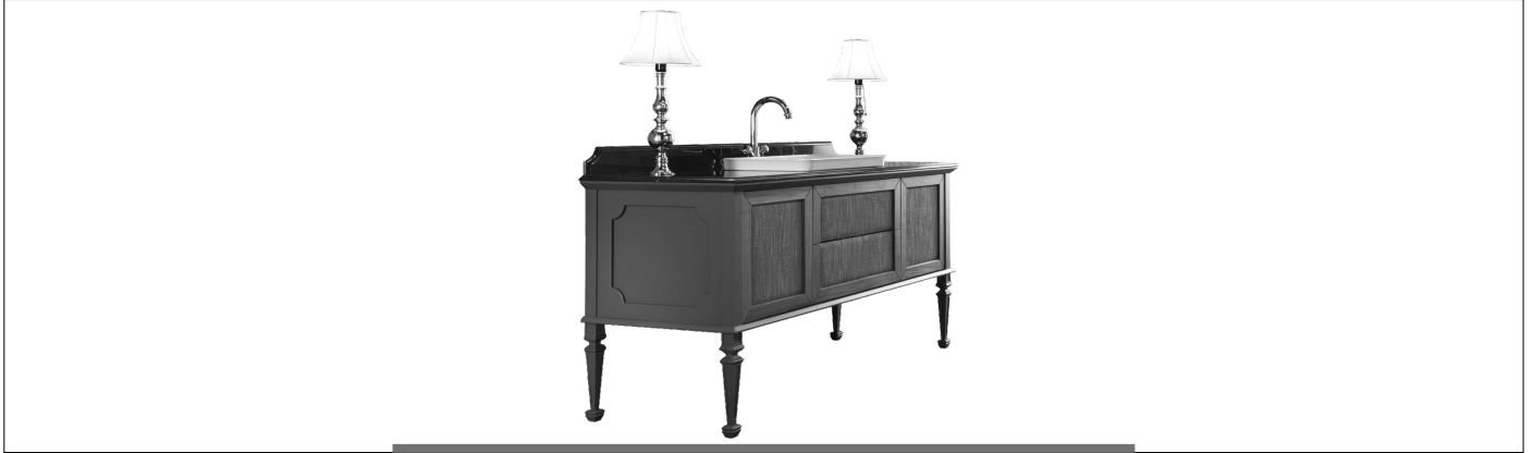
New Style-Atelier 2