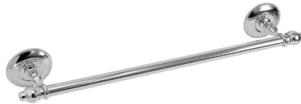
Accessori - Regent - AMRG10