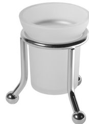
Accessori - Regent - AMRG01