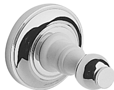
Accessori - Lincoln - AMLN06