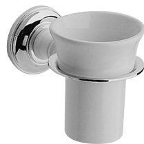
Accessori - Lincoln - AMLN00