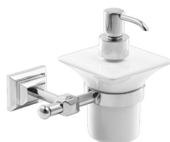
Accessori - Diamante - AMDM05