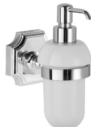
Accessori - Berkley - AMBK05