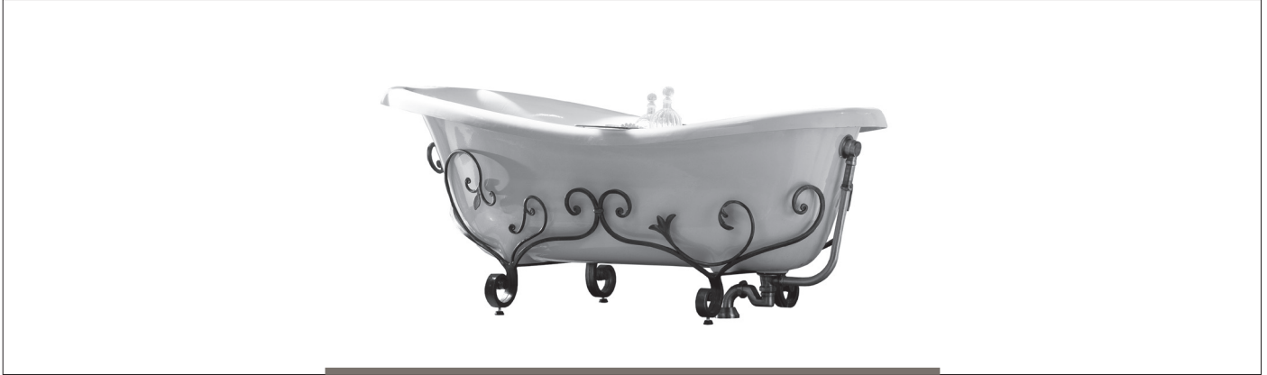
Vasche - Rose - VRP2210R VRP2220R