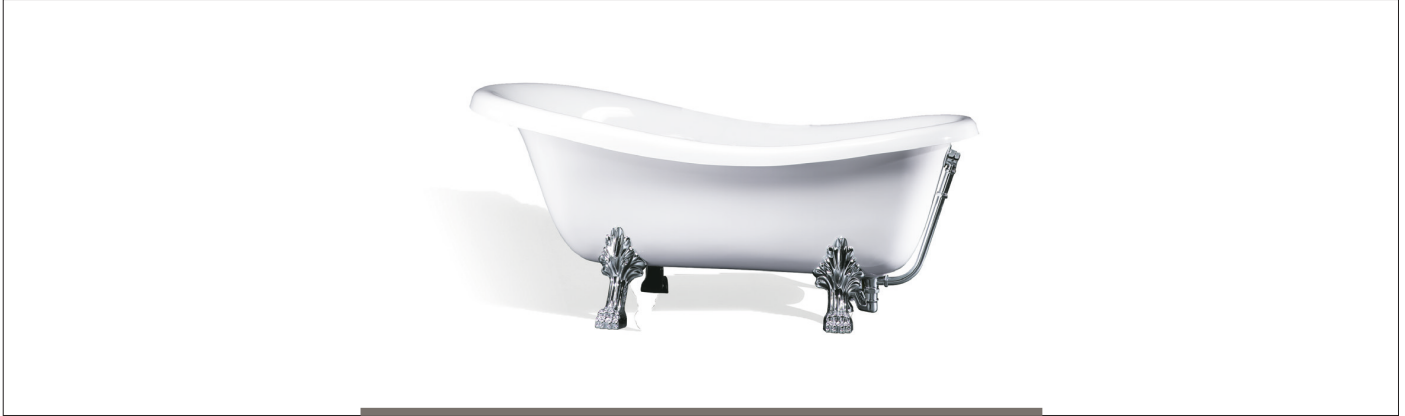
Vasche - NEW Margot - VRP2210