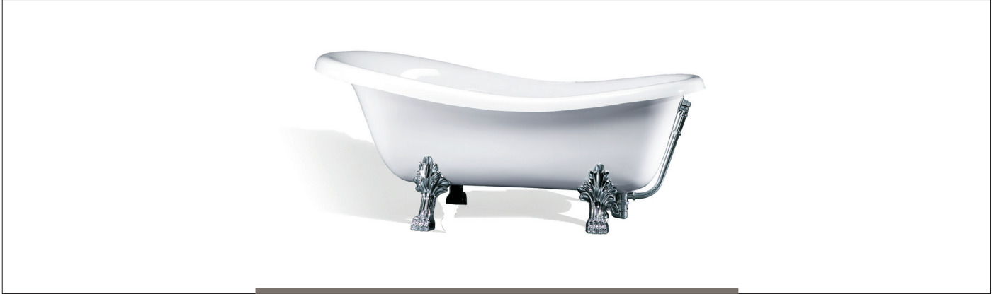
Vasche - NEW Camilla - VRP2220