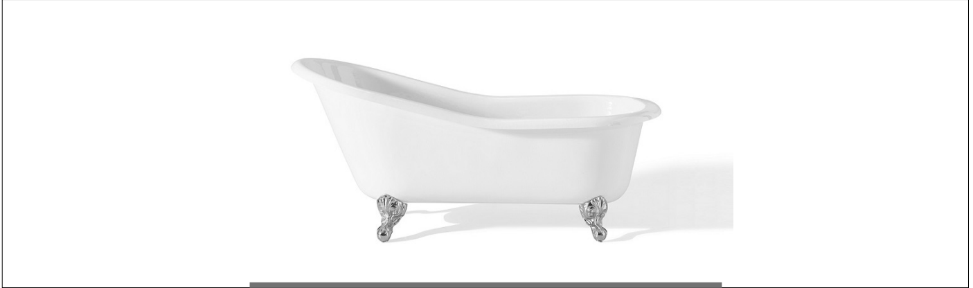
Vasche - Slipper 170 - VRG1925