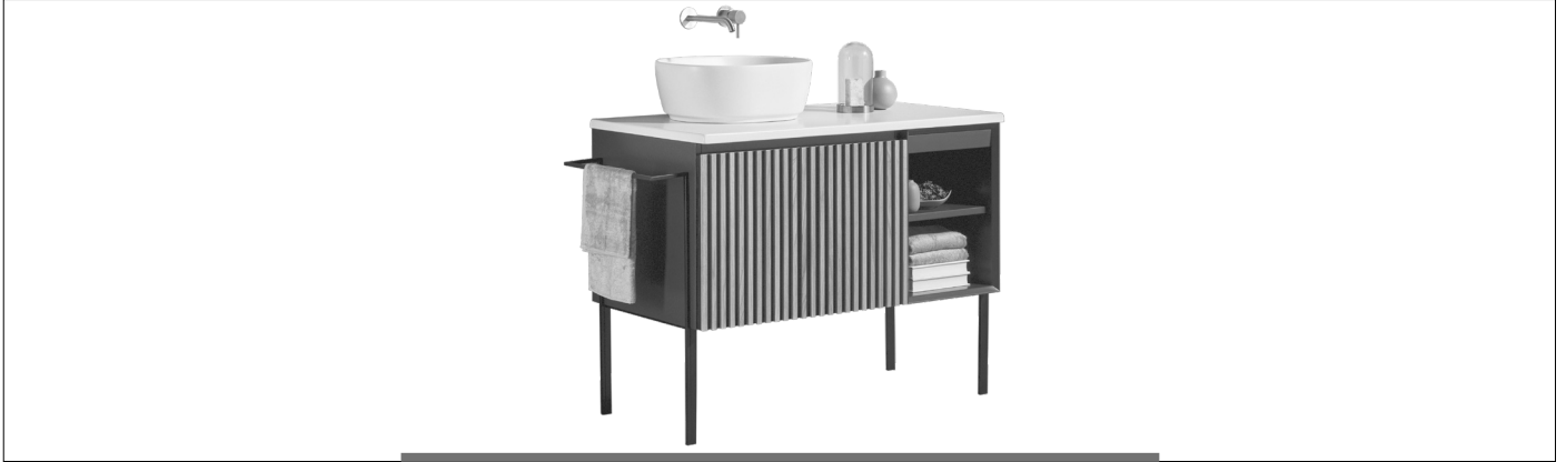
Contemporary - Garden