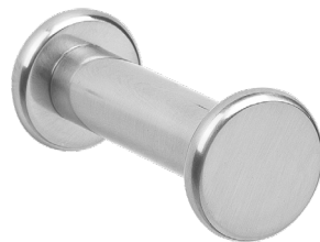
Accessori - TO15 - AMTO06