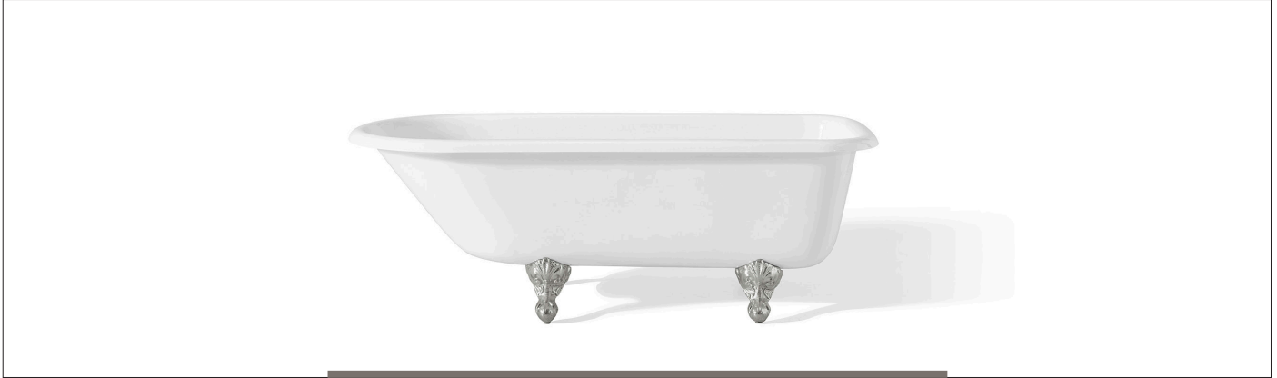
Vasche - Roll Top 154 - VRG1900