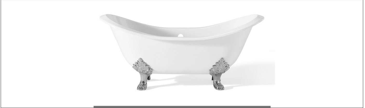
Vasche - Antique - VRG1940