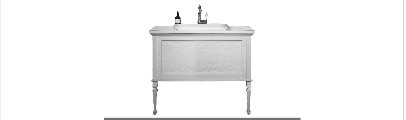
New Style - Boutique 90